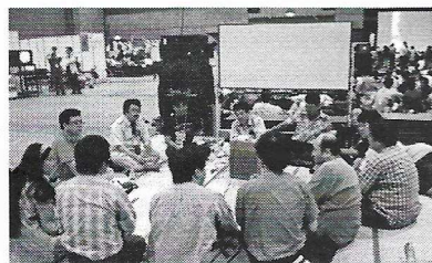
serious discussion about the Worldcon Bid in the midnight