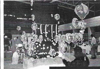
Preparations in the Exhibition Hall Right front, you can see Editorial office of "Timely Times" with yellow T-shirts personnel, "Kids-Con" Floor and Screen for Film Promotion. Left front to back, con's tea-room, dealers table, and artshow.